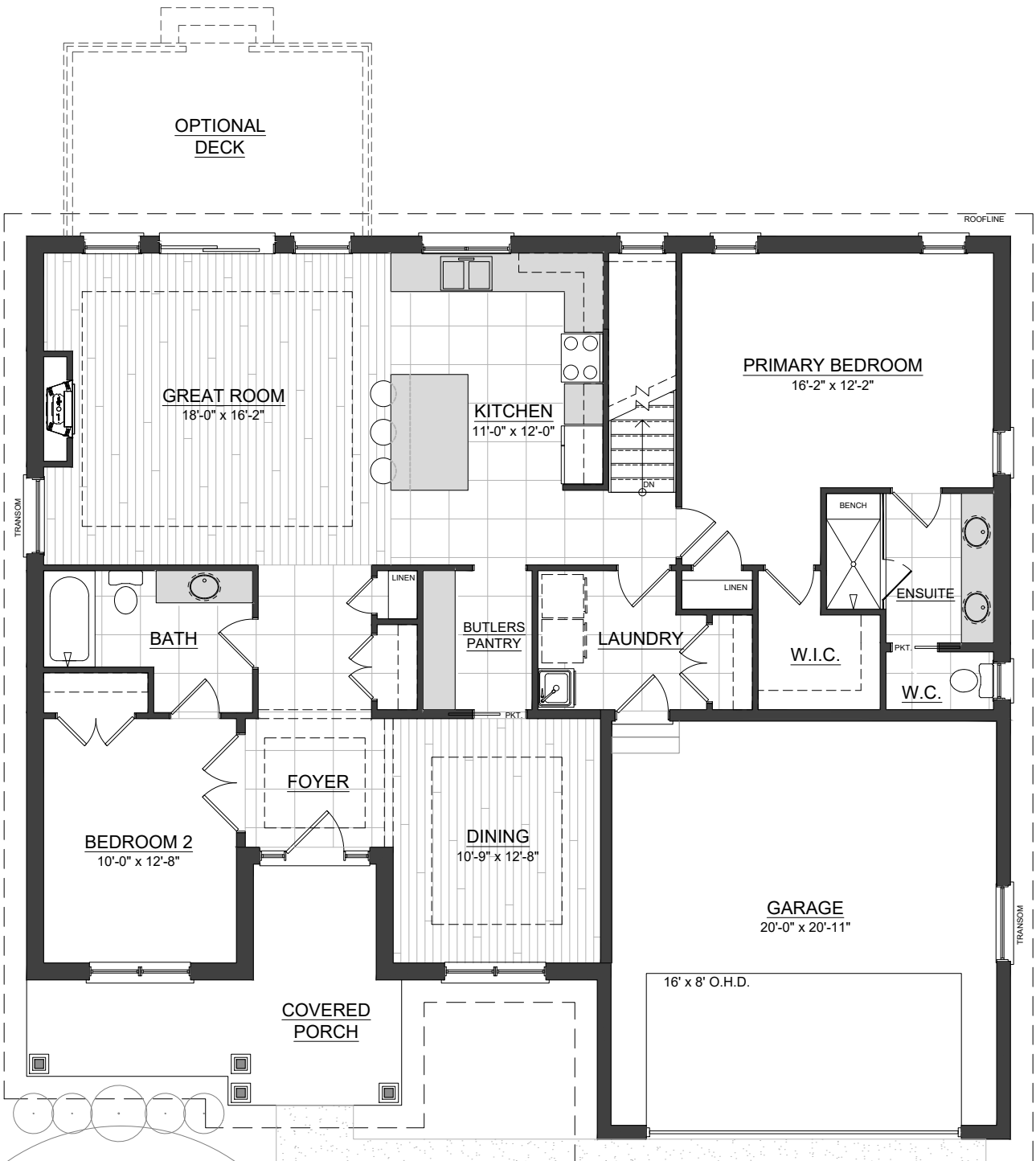
Illustration may show optional features which may not be included in the base price. Specifications subject to change without notice. E.&O.E.