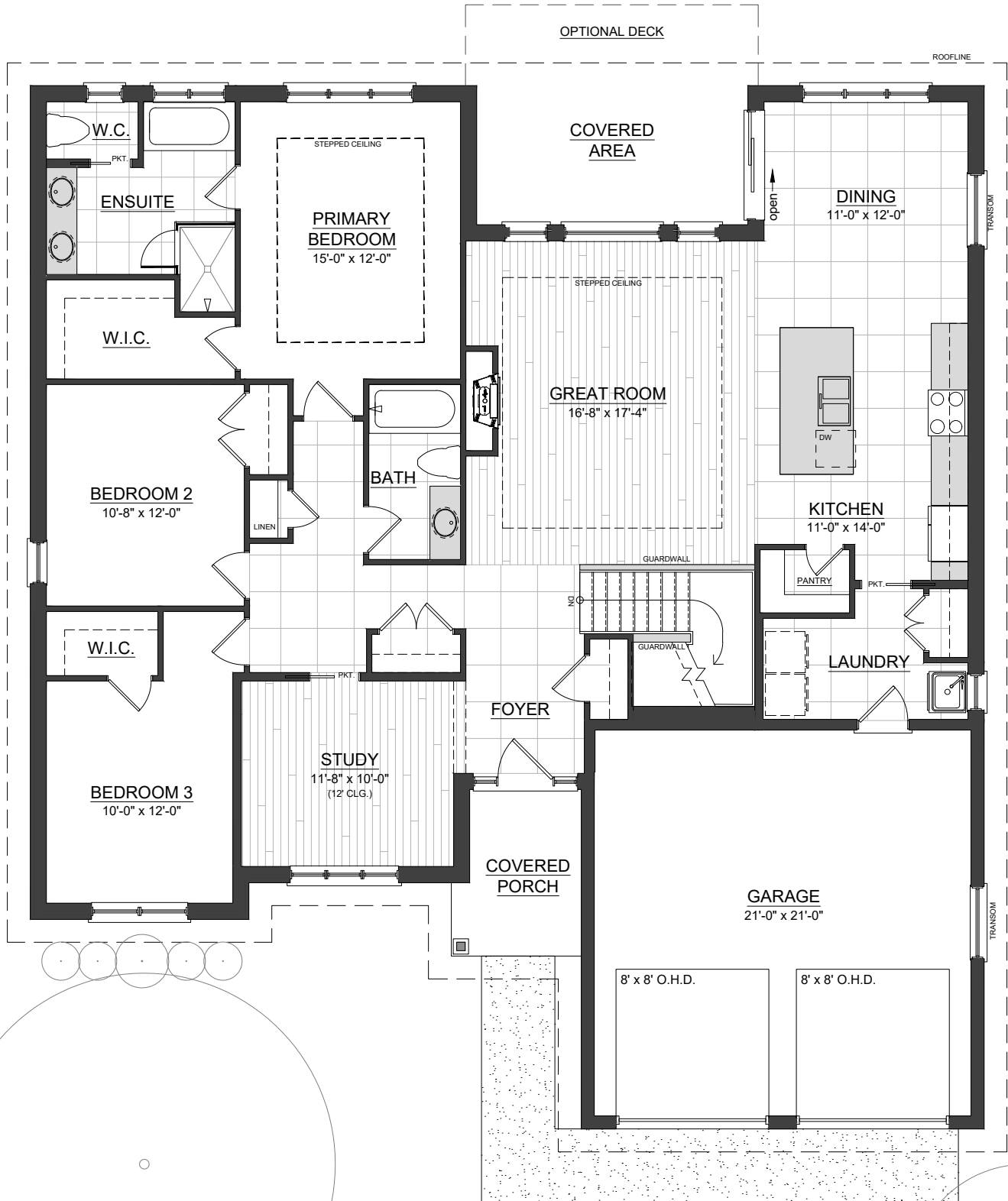
Illustration may show optional features which may not be included in the base price. Specifications subject to change without notice. Artist rendering. Dimensions are approximate. E.&O.E.