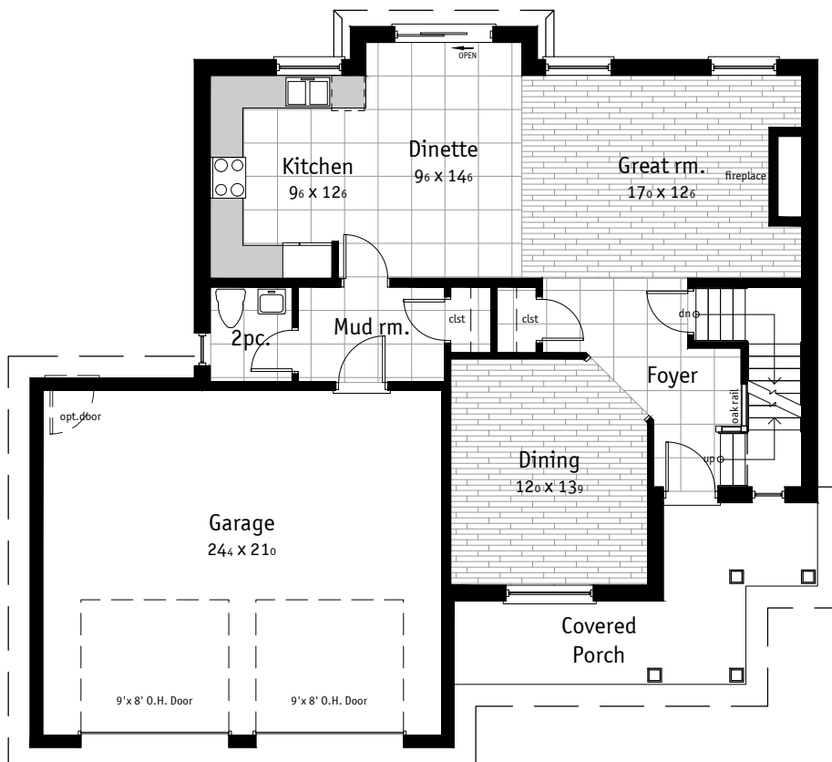
Illustration may show optional features which may not be included in the base price. Specifications subject to change without notice. E.&O.E.

www.johnstonehomes.ca phone. 519.601.9390