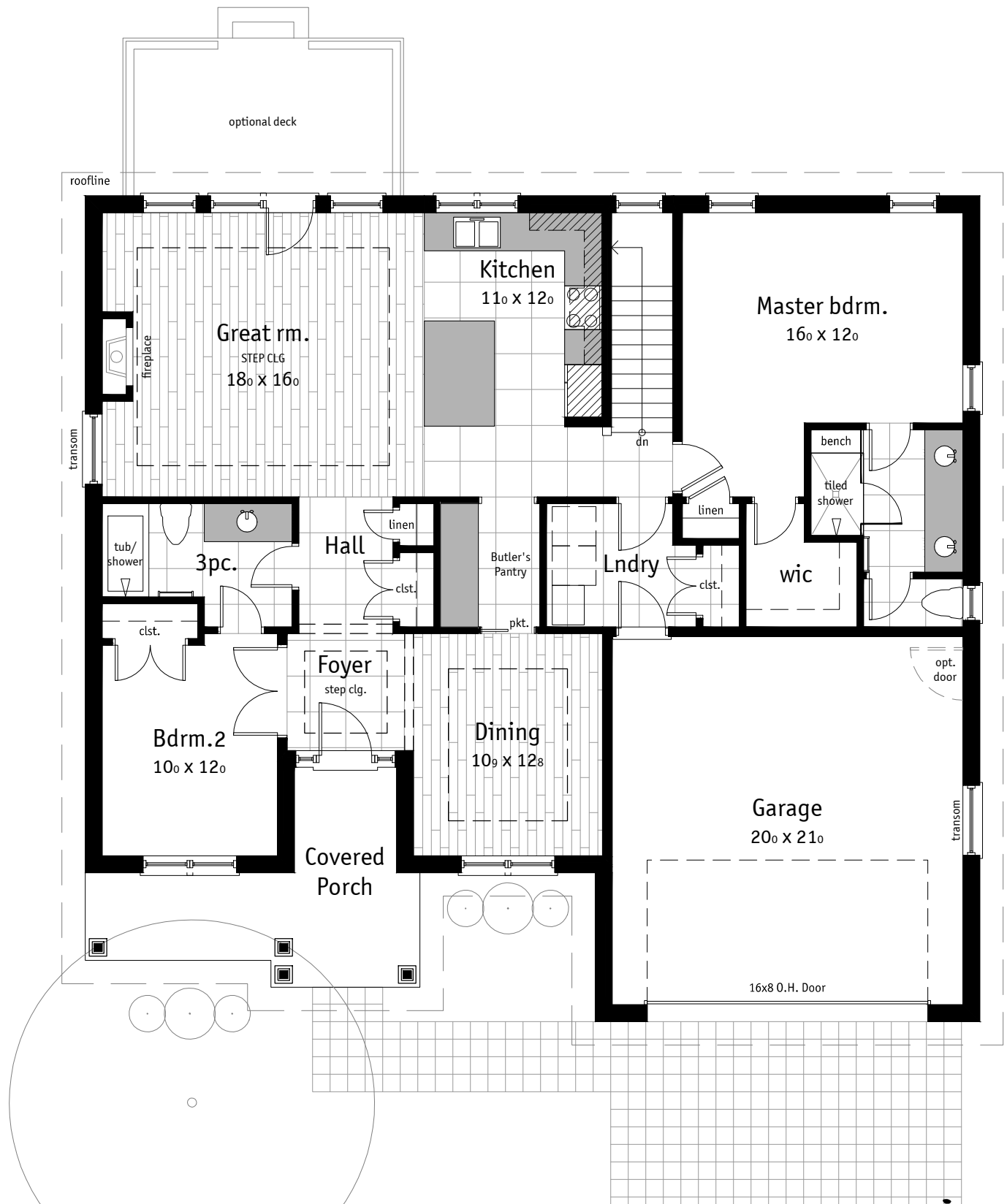
Illustration may show optional features which may not be included in the base price. Specifications subject to change without notice. E.&O.E.

www.johnstonehomes.ca phone. 519.601.9390