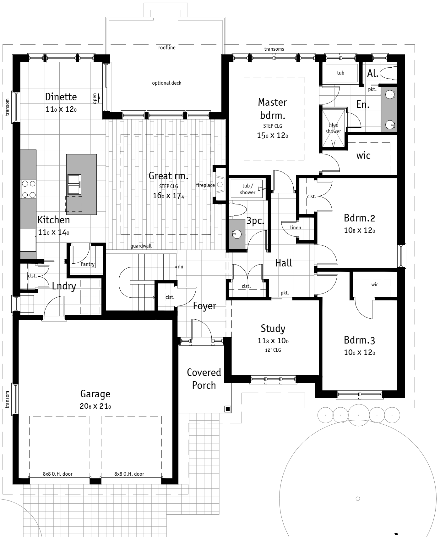
Illustration may show optional features which may not be included in the base price. Specifications subject to change without notice. E.&O.E.

www.johnstonehomes.ca phone. 519.601.9390