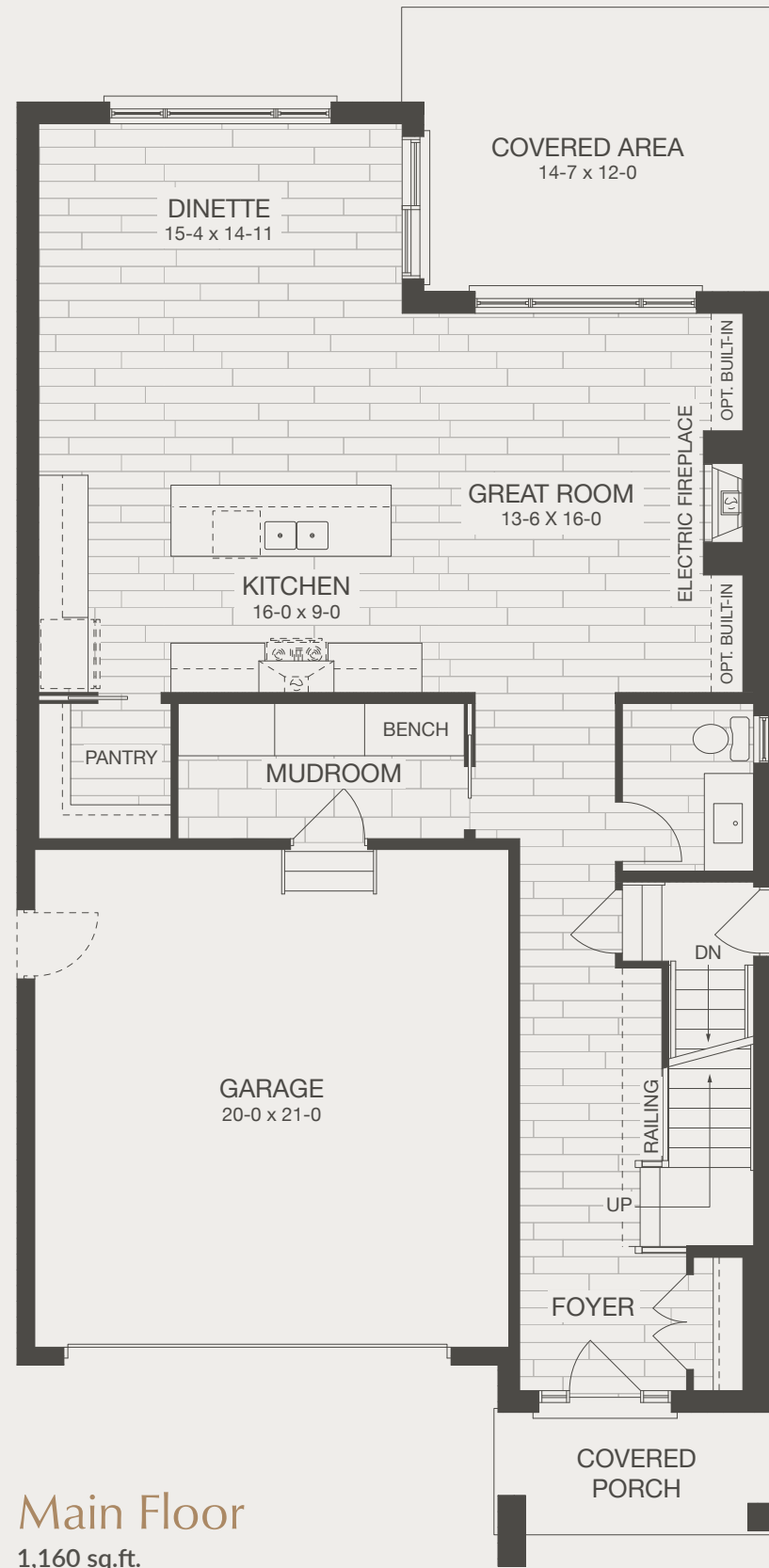
Main Floor 1,160 sq.ft.