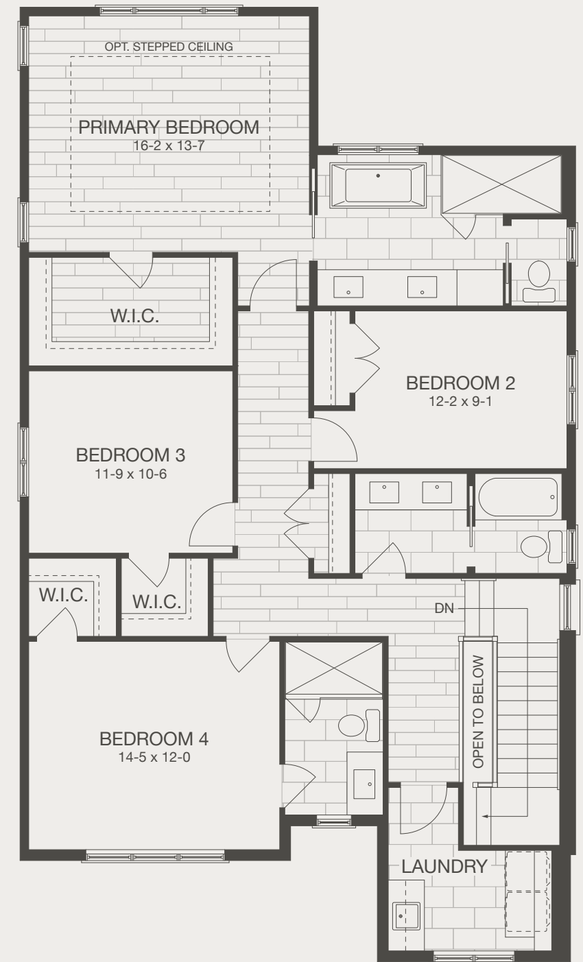
Upper Floor 1,510 sq.ft.

The Hartley - Lot 28 | 3,602 sq.ft. Includes 85 sq.ft. of open-to-below